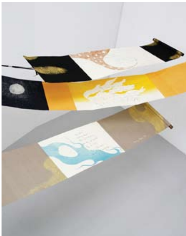
Moya Bligh, Scrolls (detail), woodblock print on washi, silk & gold leaf