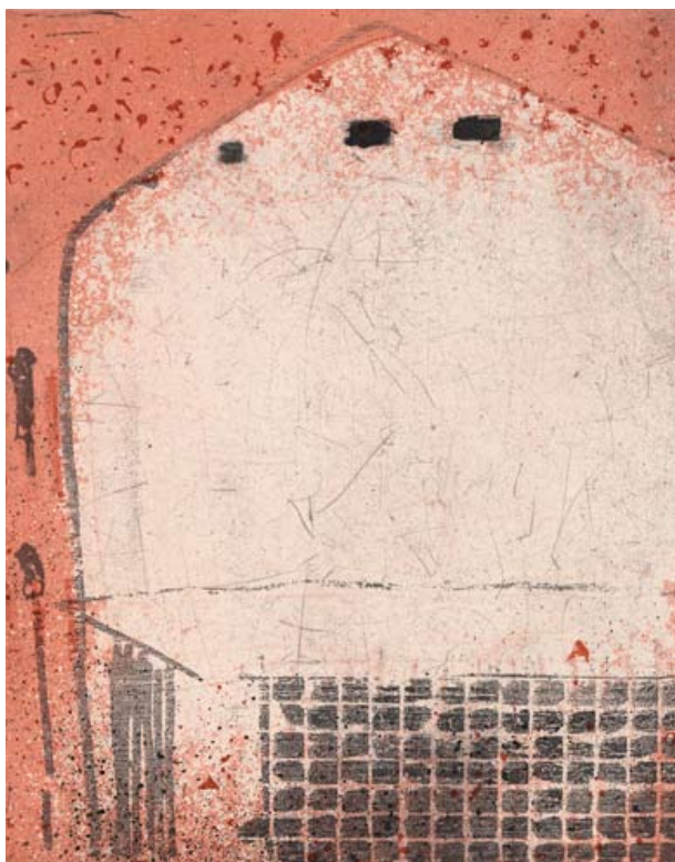
Maev Lenaghan, The End (detail), etching