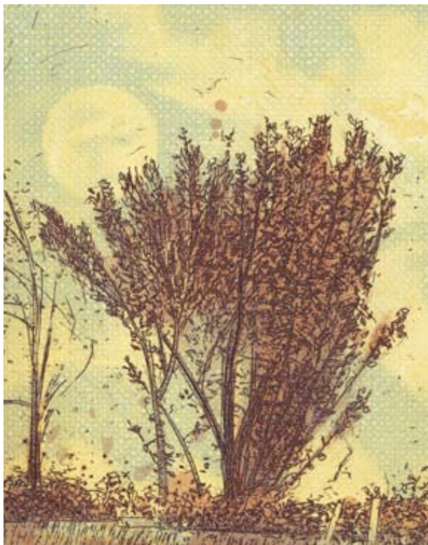
Niall Naessens, An Cuileann (detail), etching